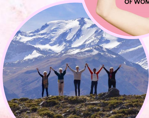
National Sales Directors on their all-expenses paid trip to Argentina

You Are Your Own Boss Freedom of Designing Your Schedule