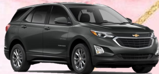
Ford Fusion or Chevy Equinox